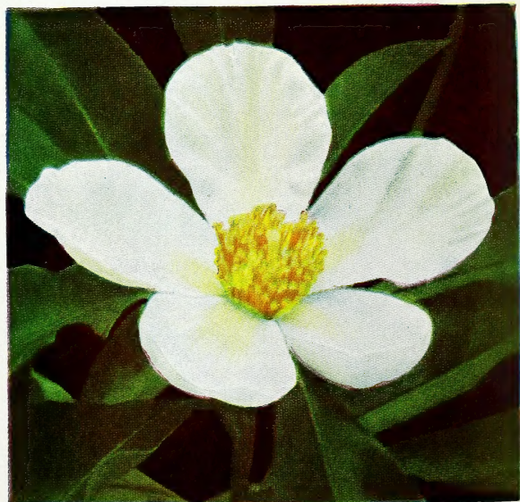
FRANKLINIA ALATAMAHA. A large shrub or small tree with large, fragrant, white flowers and deep orange stamens. Blooms first of August until frost. This has probably created more interest than any other plant in our nursery.